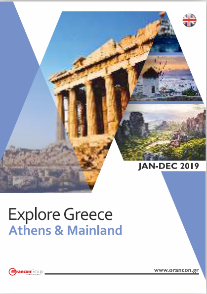
Athens & Mainland